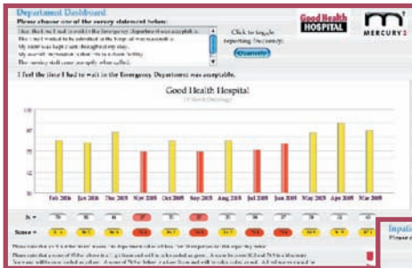
Department / Unit Dashboard

Interactivity can be developed to allow organizations to “dig” deeper into certain areas or departments / units.